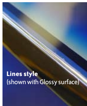
Lines style (shown with Glossy surface)