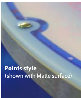
Points style (shown with Matte surface)

Custom shapes— please send your requirements for our review.