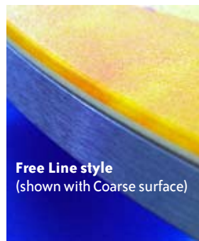
Free Line style (shown with Coarse surface)